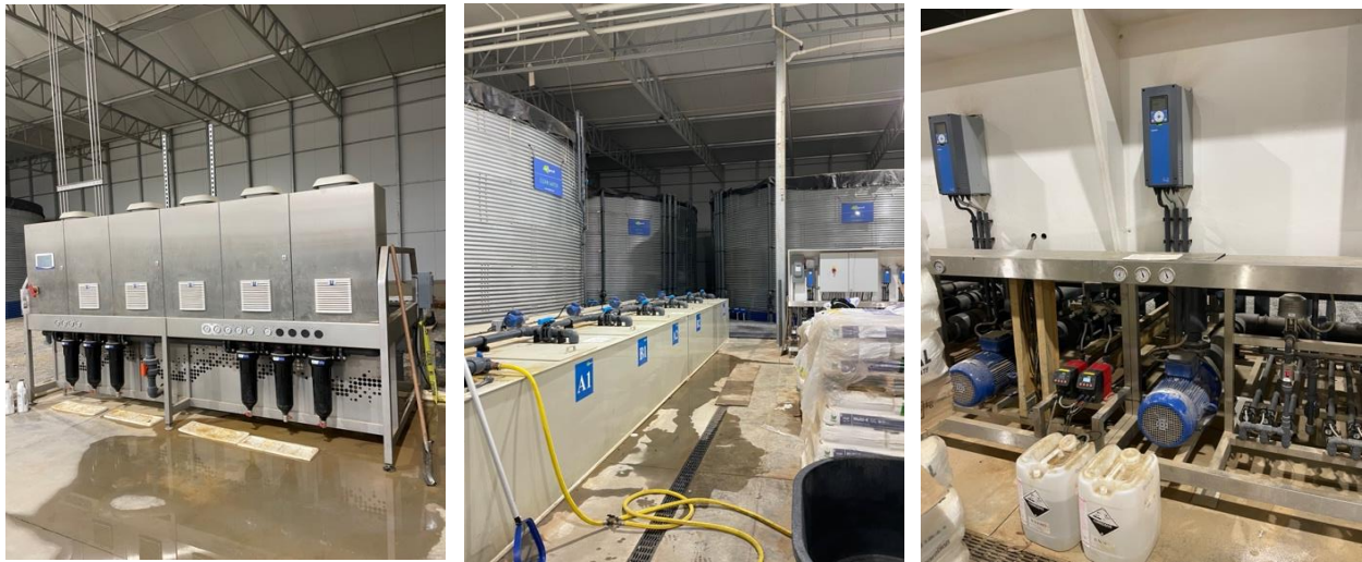
Figure 5. (Left) Fog machine, (center) fresh water tank, and fertilizer recipe tanks for flood-floor, and (right) fertilizer injectors.

fog machine to keep the humidity within the correct parameters in the greenhouse (Fig. 5).