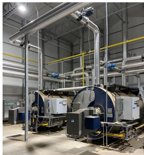
Figure 7. (Left) Hot water holding tank, and (right) boilers for heating the facility.

Our entire greenhouse environment is controlled by IIVO Hoogendoorn https://readyssetgrow.nl/ . Just a few of the benefits of IIVO are ease of use, weather forecasting that will close vents in case of a storm, and my favorite - it can be controlled remotely with your phone. Our growers are able to access real time information from the greenhouse environment. We are also able to look at a year's worth of data, in an easy-to-read graph.