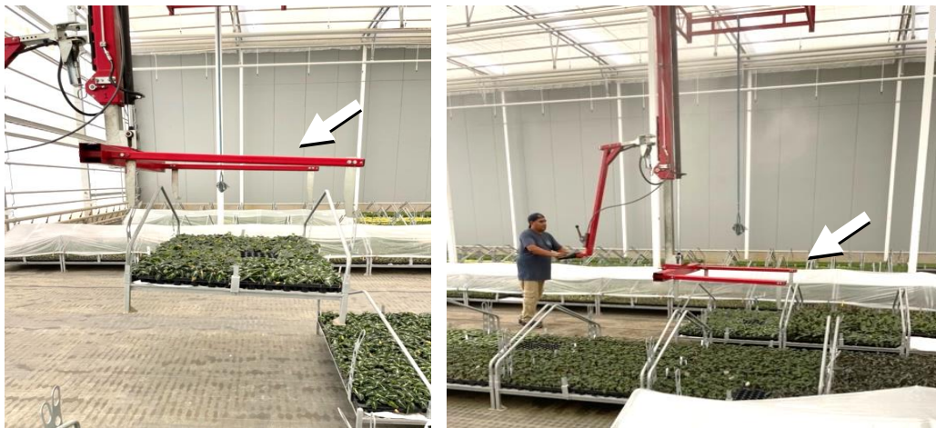
Figure 3. (Left) Flying forks (arrows) moving grow racks. (Right) Operator controlling grow racks.

This same equipment will be used to pick up grow racks of fully rooted plants for planting into 12-cm or 17-cm recycled plastic pots. We load our trailers with finished liners and head to the potting line ( Fig. 1 ). Our machine has a pot dispenser that releases the pots onto the conveyor, fills the pot with media and dabbles a hole. Once planted the pot will go through a series of irrigation nozzles to lightly water the plant for its trip to the greenhouse. The potted plants are then gathered on the rail for the robot to place onto the trailer (Fig. 1). When a line on the trailer is full the trailer moves forward the required space for the next row of plants. When two trailers are full of