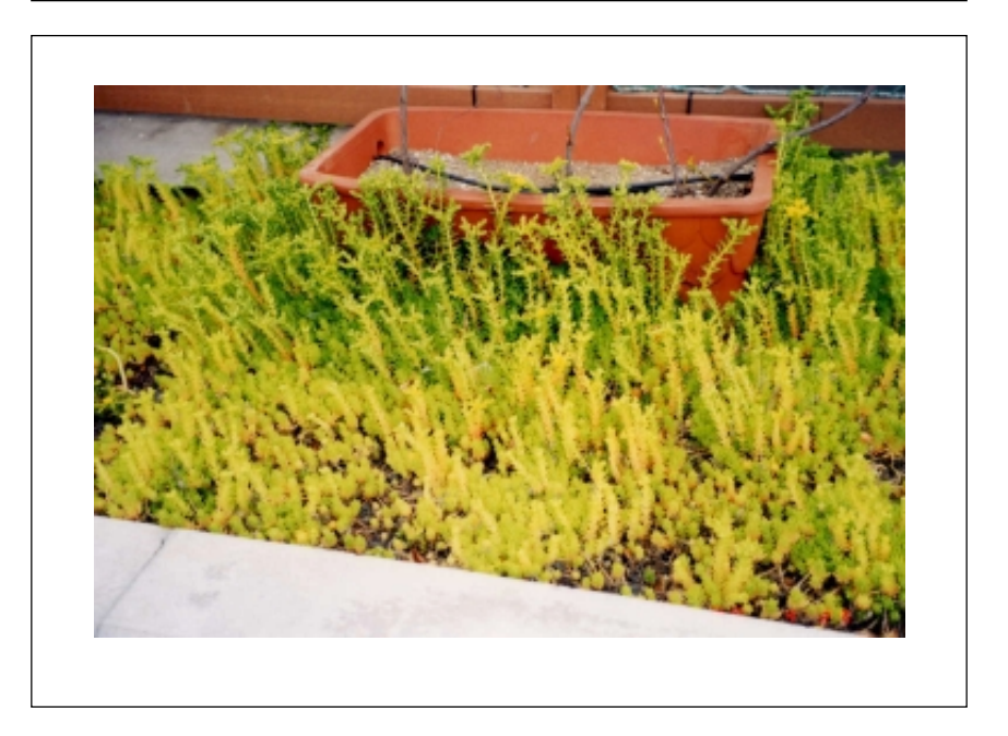
Figure 2. Sedum mexicanum.