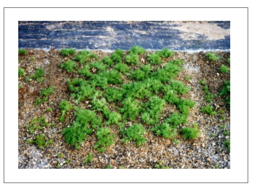
Figure 7. Sedum mexicanum.