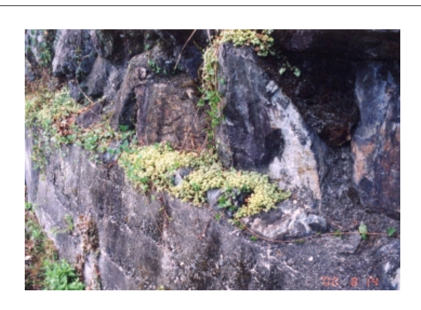
Figure 4. Sedum makinoi.

I recognize that the leading figures in rooftop planting are plants. Our duty is growing and developing them to be adaptable and dry-weather durable against the harsh environment of the roof. That is a very important task for plant propagators.