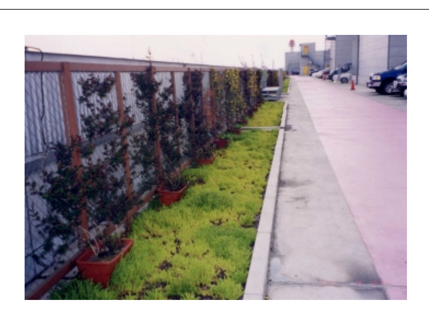
Figure 1. Oji Company initiated project for rooftop planting.

I chose S. mexicanum as my test plant (Figs. 6 and 7), however, I have faced many difficulties. Dry weather durable S. mexicanum often suffers from Japanese high temperature and humidity conditions. It also exhibits some damage if it grows