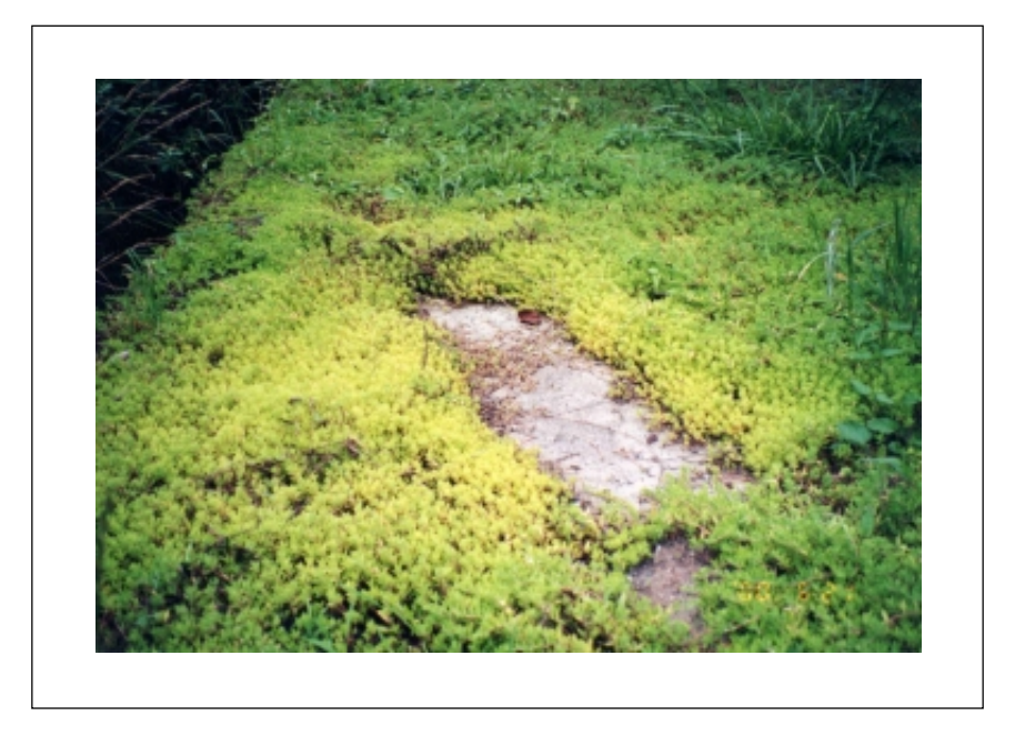
Figure 3. Sedum sarmentosum.