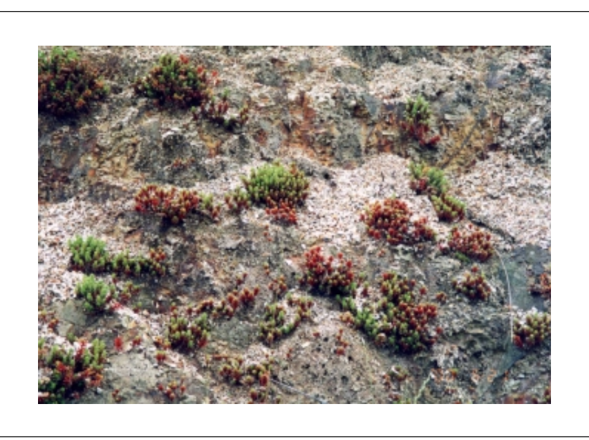
Figure 5. Sedum oryzifolium.