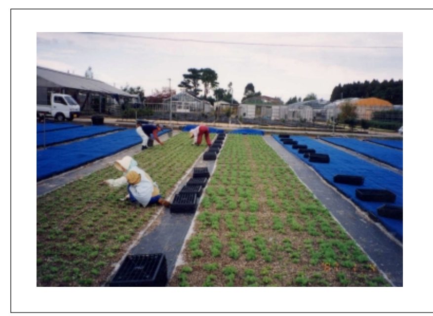
\textbf{Figure 6.} \ \textit{Sedum mexicanum} \ \textbf{used as a test plant}.