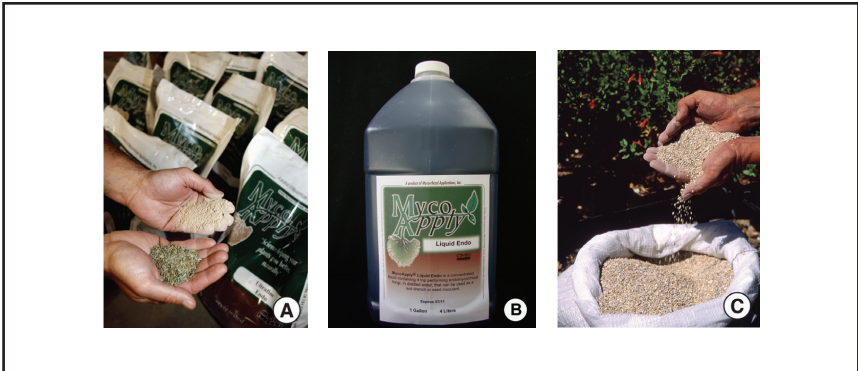
Figure 4. Arbuscular mycorrhizal inoculums are available in powder, liquid, or granular formulations, which allows for a wide variety of application methods and timing