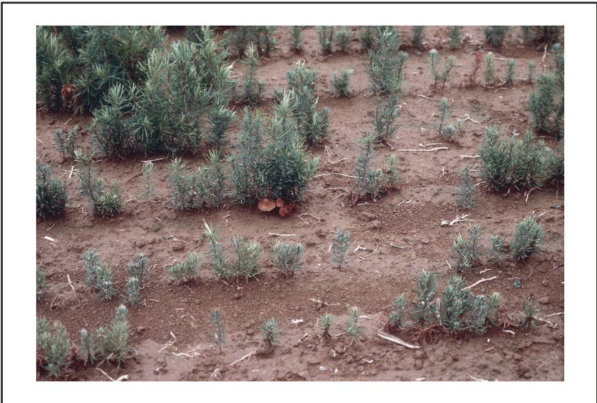
Figure 2. The slow and irregular recolonization of fumigated soils produces a mosaic growth pattern of healthy plants with mycorrhizae (note mushrooms) and stunted plants without mycorrhizae.