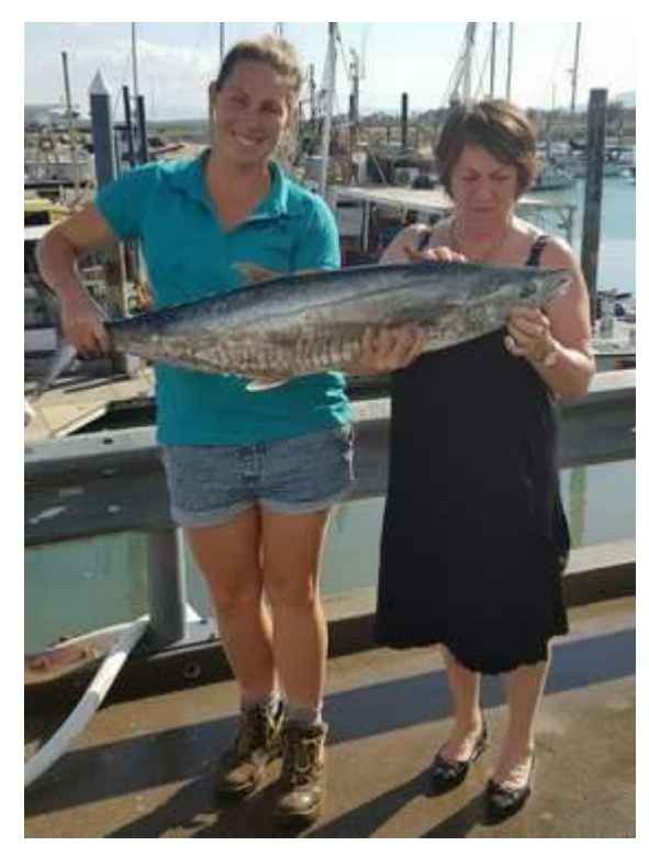
Fisherman's Co-op Bowen - lunch?