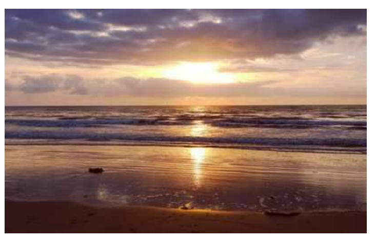
Mission beach sunrise