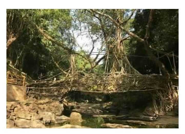
Photo - Living root bridge, Pynursla, East Khasi Hills, Meghalya, India - a must see for the 'plantsman'