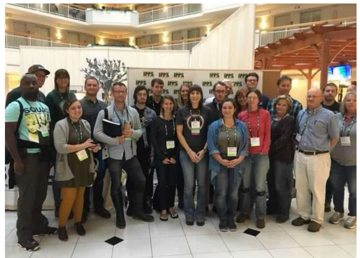
From the IPPS Eastern region newsletter article by Shelby French of some delegates who attended the 2018 Eastern Region conference