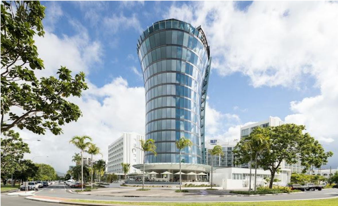
Venue: Crystalbrook Riley, Cairns